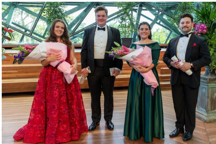
Image: The 2024 Finalists on 18 November 2023 at the Opera Finale in The Edge, Federation Square